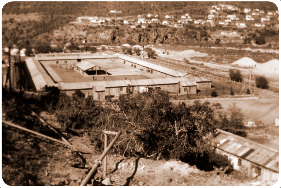
Gamtoos Irrigation Board

Later it was realised that the dam also had the potential to supply water to Port Elizabeth and renowned water engineer Ninham Shand was appointed by the town council to report on this possibility. The town council resolved to proceed with the Kouga scheme on the basis of a supply drawn from the end of a canal system at Loerie. In 1963, Council negotiated an agreement with government for a water supply from the scheme which was redefined as dual purpose, namely irrigation and urban usage. The agreement provided for the supply