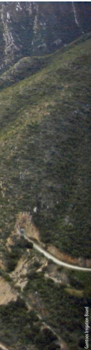
Gamtoos Irrigation Board

distribution canals were constructed by several farmers in the district who wanted a share of one of South Africa's most lucrative export products at the time. Where weirs were impractical steam and oil pumps were used to bring water from the river to the field.