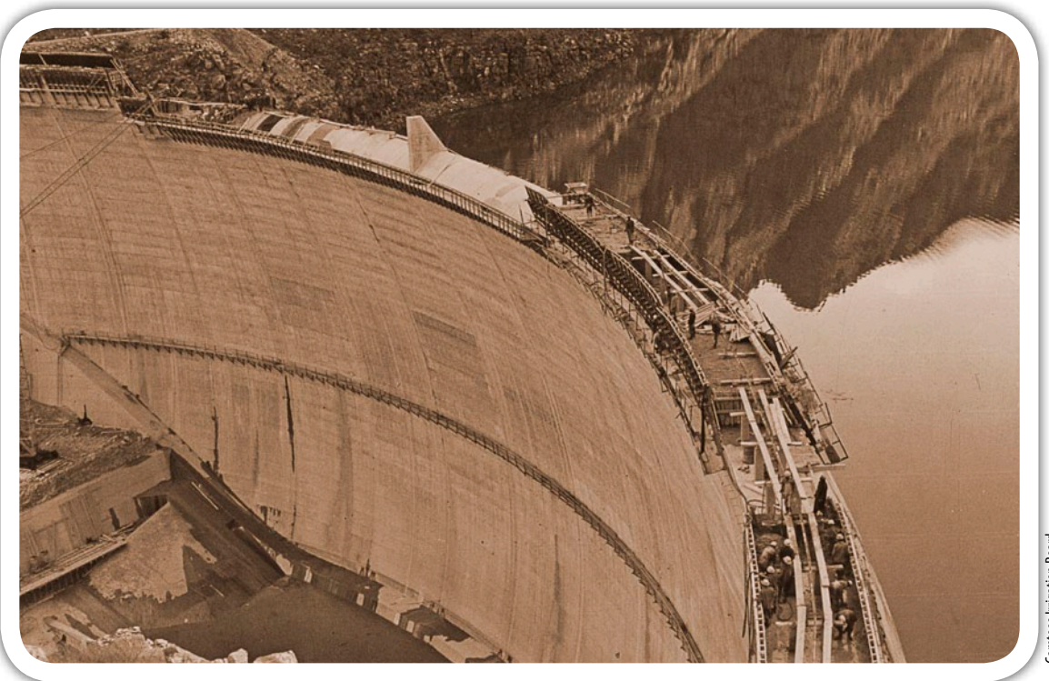
Gamtoos Irrigation Board

Another notable flood hit the region in 1932, this time destroying