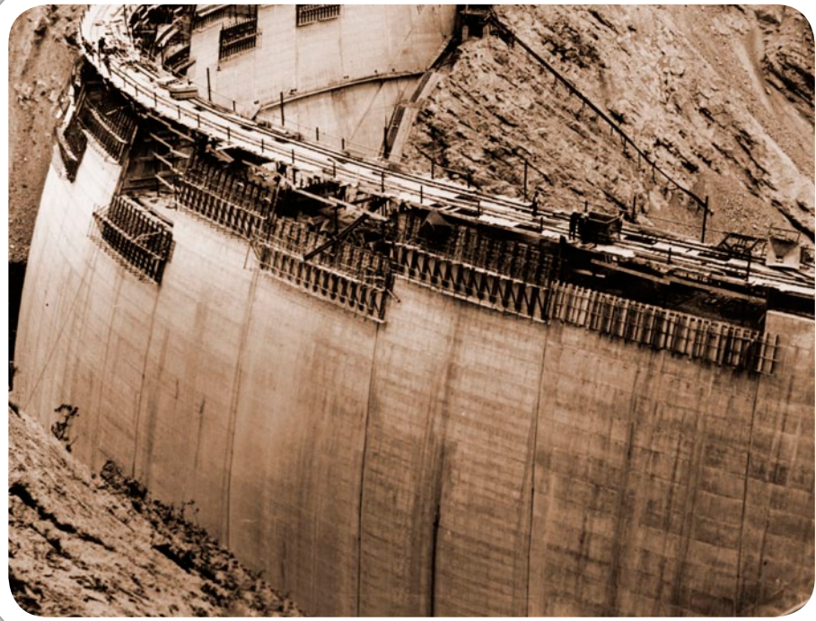
Gamtoos Irrigation Board

Top: An elaborately guarded prison camp was constructed on site at Kouga to house the approximately 400 black convicts that worked on site. A similar camp was constructed at Beervlei.